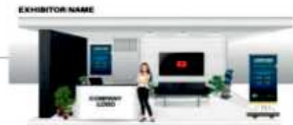
Colour Option 5