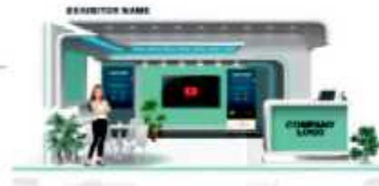
Colour Option 5