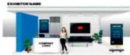
Colour Option 2