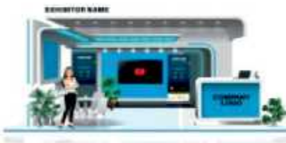
Colour Option 1