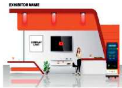
Colour Option 2