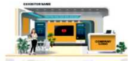
Colour Option 3