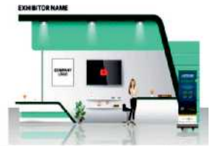
Colour Option 3