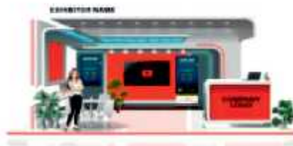
Colour Option 2