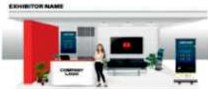
Colour Option 1