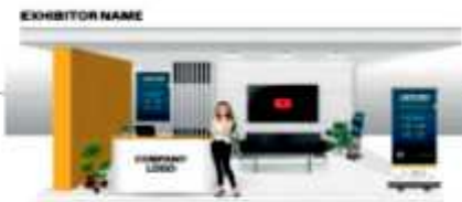
Colour Option 4