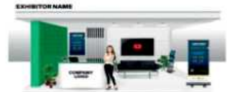
Colour Option 3