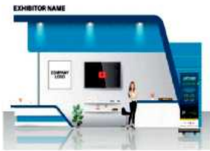
Colour Option 1