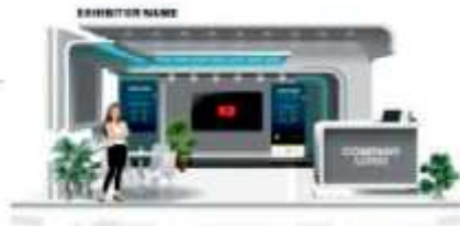
Colour Option 4